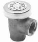
ATMOSPHERIC VACUUM BRAEKER