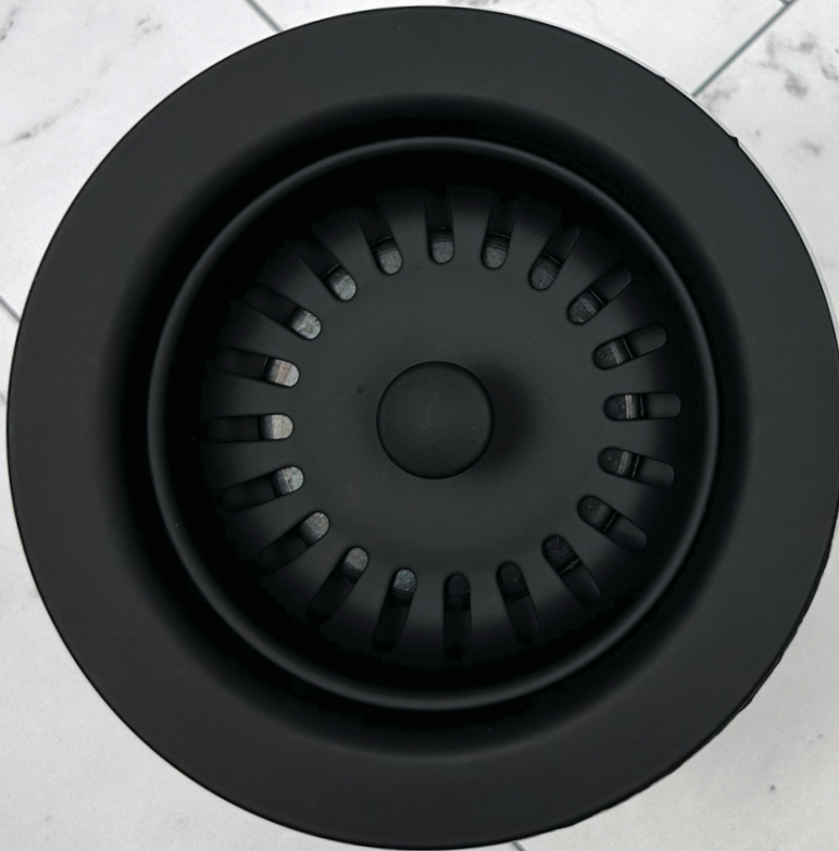
Cerakote® Matte Black (MBC)