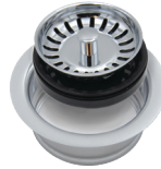
MT200EV/BRS Stopper/Strainer Disposer Trim