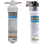
MT1250XL + MT3K-HF Point-of-Use Water Filter & 3,000 Gallon Full Flow Filter