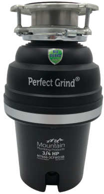
MT666-3CFWD3B 3/4 HP Garbage Disposer

The basics needed to complete your Kitchen Sink. Additional upgrades available below.