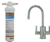
MT1250XL + Hot/Cold Francis Anthony Accessory Faucet (in CPB) Point-of-Use Filter