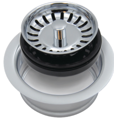
MT200EV/BRS Stopper/Strainer Disposer Trim